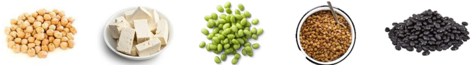
Chickpeas, black beans, kidney beans, white beans, green peas, lentils, edamame, organic tofu, organic tempeh

Add hearty plant protein with beans and legumes, 1/2 cup