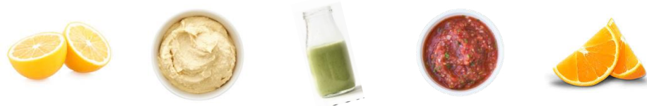
A squeeze of lemon, lime or orange juice, guacamole, balsamic vinegar, white wine vinegar, salsa, hummus, oil-free dressing

Add flavor with a squeeze of citrus, a dollop of dip, or a drizzle of dressing