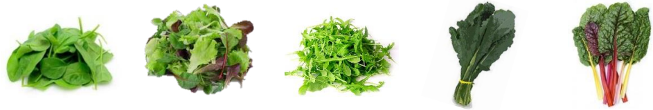
Baby spinach, chopped kale, Swiss chard, arugula, shredded cabbage, lettuce, spring mix, shaved Brussels sprouts, etc.

Start with a hefty base of leafy greens, 2 to 3 cups