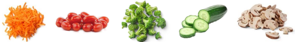
Artichoke hearts, asparagus, bell peppers, broccoli, carrots, cauliflower, cucumber, microgreens, mushrooms, onion, snap peas, summer squash, tomatoes, etc.

Add texture and color with a variety of vegetables, raw, steamed or roasted, unlimited